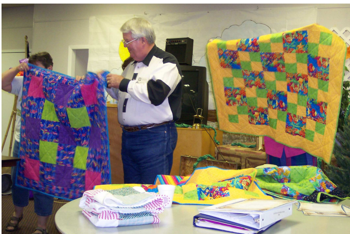
The Cotton Strippers display quilts made for Community Service.