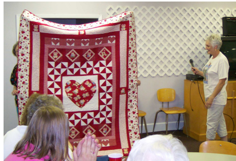
Long lost projects were completed!