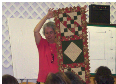
Our program was GREAT!